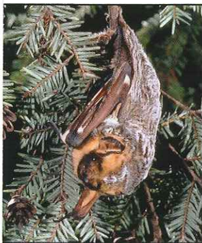
Hoary Bat ( Lasiurus cinereus )

Most of the recent human rabies cases in the United States have been caused by rabies virus from bats. Awareness of the facts about bats and rabies can help people protect themselves, their families, and their pets. This information may also help clear up misunderstandings about bats.