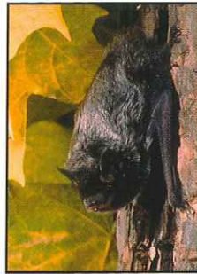
Silver-haired Bat ( Lasionycteris noctivagans )

People usually know when they have been bitten by a bat. However, because bats have small teeth which may leave marks that are not easily seen, there are situations in which you should seek medical advice even in the absence of an obvious bite wound. For example, if you awaken and find a bat in your room, see a bat in the room of an unattended child, or see a bat near a mentally impaired or intoxicated person, seek medical advice and have the bat tested.