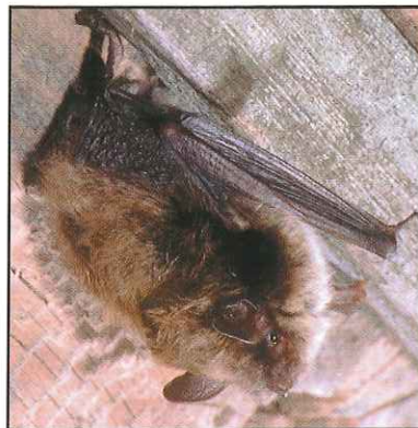
Little Brown Bat ( Myotis lucifugus )

Yes. Worldwide, bats are a major predator of night-flying insects, including pests that cost farmers billions of dollars annually. Throughout the tropics, seed dispersal and pollination activities by bats are vital to rain forest survival. In addition, studies of bats have contributed to medical advances including the development of navigational aids for the blind. Unfortunately, many local populations of bats have been destroyed and many species are now endangered.