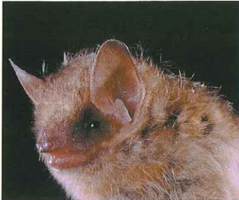
Eastern Pipistrelle ( Pipistrellus subflavus )

securely, and punch small holes in the cardboard, allowing the bat to breathe. Contact your local health department or animal-control authority to make arrangements for rabies testing.