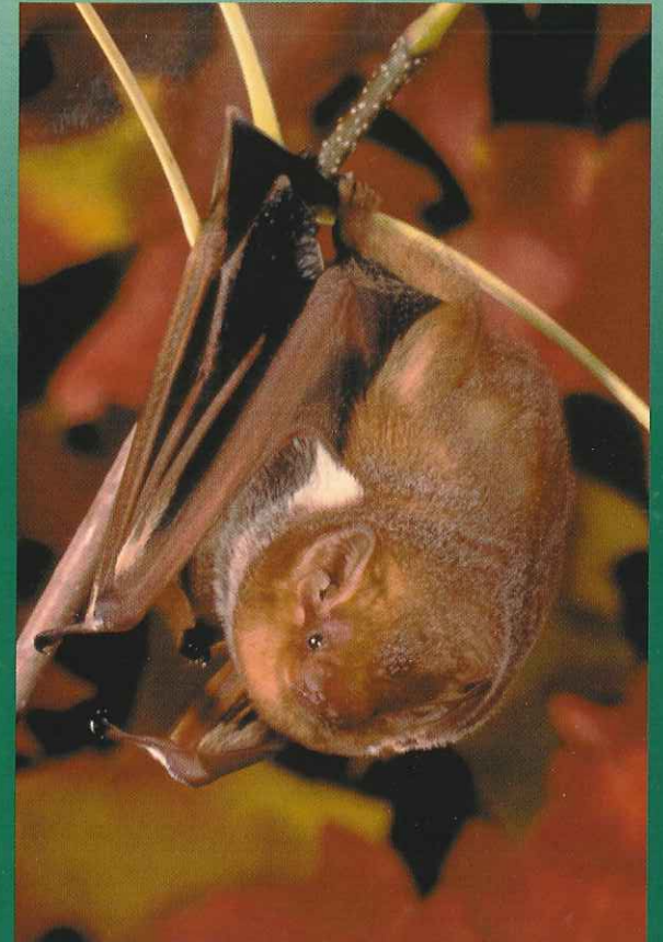
Eastern Red Bat ( Lasiurus borealis )