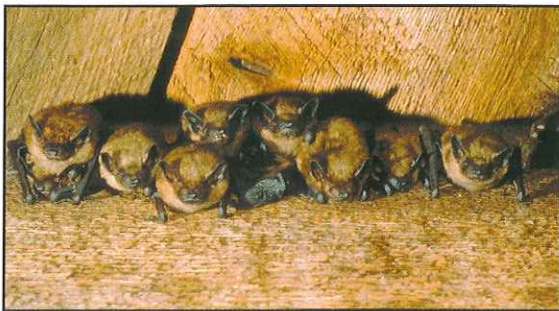
Big Brown Bat ( Eptesicus fuscus )

If you see a bat in your home and you are sure no human or pet exposure has occurred, confine the bat to a room by closing all doors and windows leading out of the room except those to the outside. The bat will probably leave soon. If not, it can be caught, as described, and released outdoors away from people and pets.